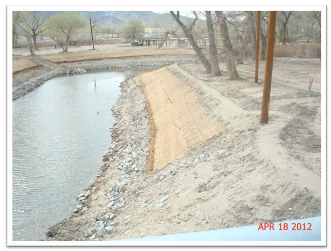
After Construction at ER-34