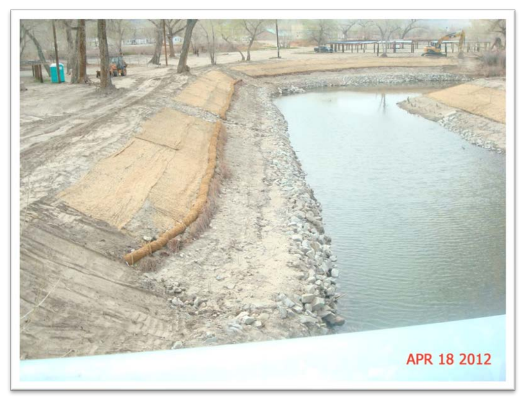
After Construction at ER-34