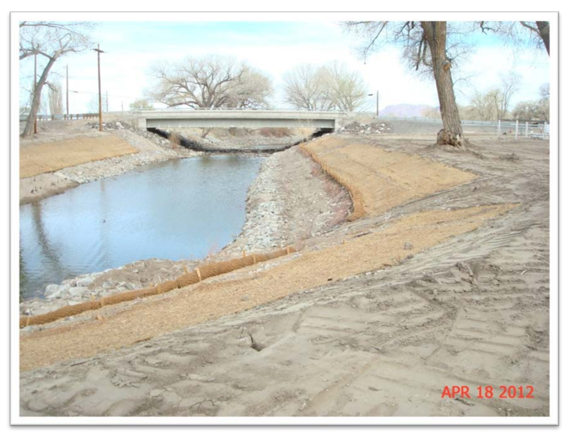
After Construction at ER-34