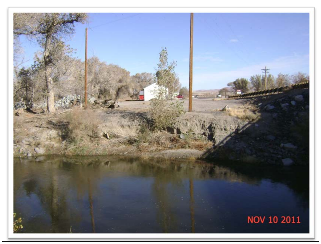
Before Construction at ER-34